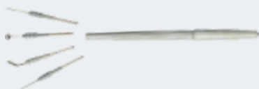
Chuk Handle With Electrode Autoclavable