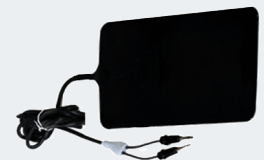
Silicon Patient Plate ( Optional )