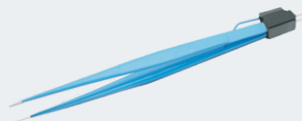
Bipolar Forcep Autoclavable With Cable