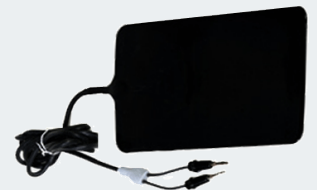
Silicon Patient Plate ( Optional )