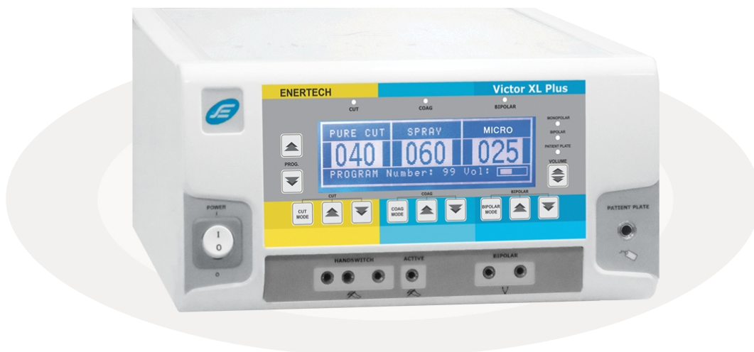
Victor XL Plus

Enertech providing it's widest range of high performance state of the art COST EFFECTIVE Electro Surgical Generators available today in the market. The machines come with Instant Tissue response technology and Tissue impedance measurement systems. These models offer top of the line features like 99 program modes, multiple blend modes, endo cut facility, best monopolar cutting and coagulation performance with precision controlled bipolar output and host of safety features with adherence to EC 60601 guidelines. The range also includes low cost analog models for price conscious customers.