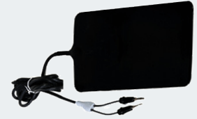
Silicon Patient Plate ( Optional )