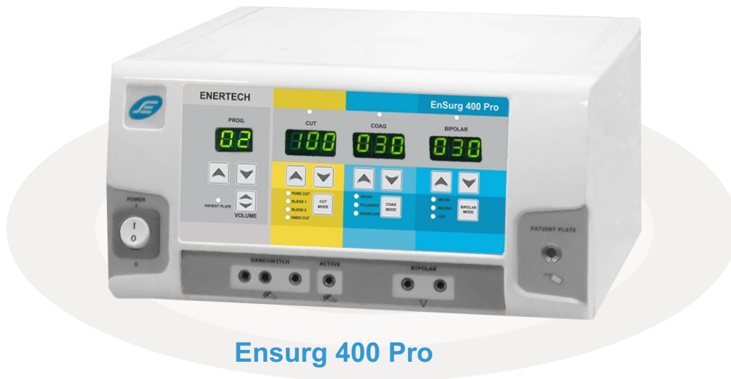
Ensurg 400 Pro

Enertech providing it's widest range of high performance state of the art COST EFFECTIVE Electro Surgical Generators available today in the market. The machines come with Instant Tissue response technology and Tissue impedance measurement systems. These models offer top of the line features like 99 program modes, multiple blend modes, endo cut facility, best monopolar cutting and coagulation performance with precision controlled bipolar output and host of safety features with adherence to EC 60601 guidelines. The range also includes low cost analog models for price conscious customers.